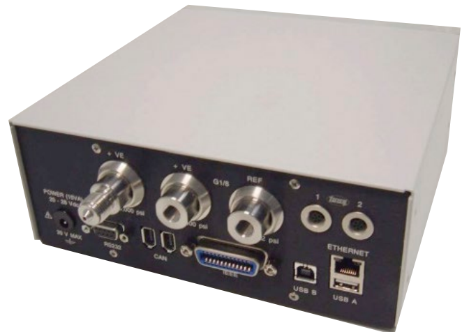
PACE Tallis from the rear