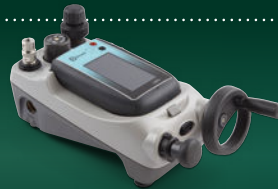
DPI620G + PV622 + PM620 Portable 100 bar/1500psi pneumatic pressure calibrator