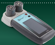
DPI620G + MC620G + PM620 1,000 bar/15000psi pressure calibrator