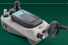
DPI620G + PV623 + PM620 Portable 1,000 bar/15000psi hydraulic pressure calibrator