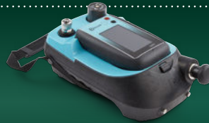
DPI620G + PV624 + PM620 20 bar/300psi hybrid pneumatic pressure calibrator