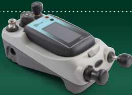
DPI620G + PV621 + PM620 Portable 20 bar/300psi pneumatic pressure calibrator