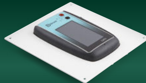
DPI620G + Panel Mount accessory Electrical/Pressure measurement as part of test bench system