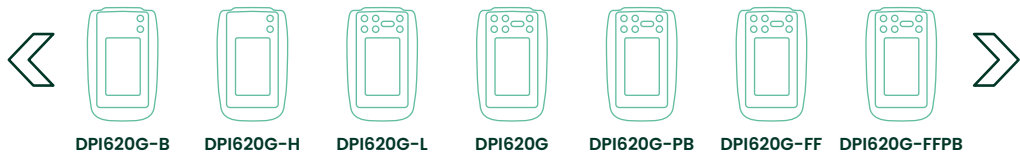
DPI620G-B DPI620G-H DPI620G-L DPI620G DPI620G-PB DPI620G-FF DPI620G-FFPB